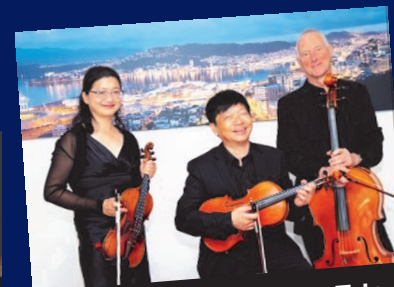
Aroha String Trio