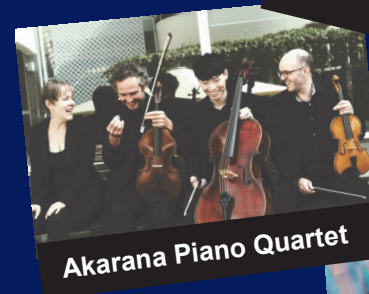
Akarana Piano Quartet