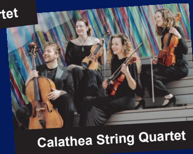
Calathea String Quartet

New Zealand and international musicians present outstanding performances of music for small ensembles